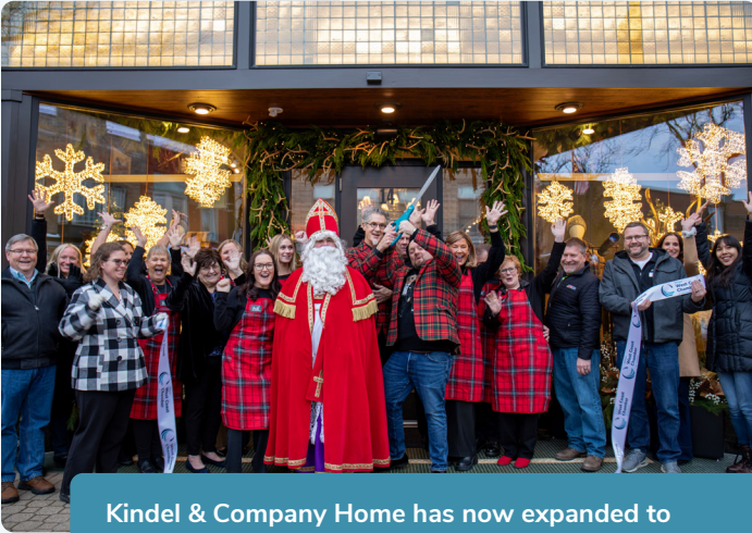
Kindel & Company Home has now expanded to Holland with their new Haberdashery on 8th street.