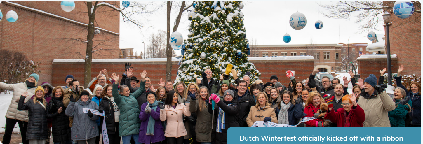
Dutch Winterfest officially kicked off with a ribbon cutting celebrating the Delft Downtown art exhibit.