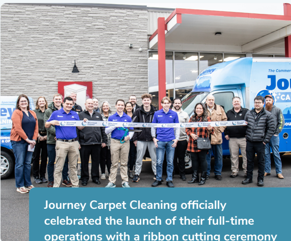
Journey Carpet Cleaning officially celebrated the launch of their full-time operations with a ribbon cutting ceremony at one of their long-term client's location.