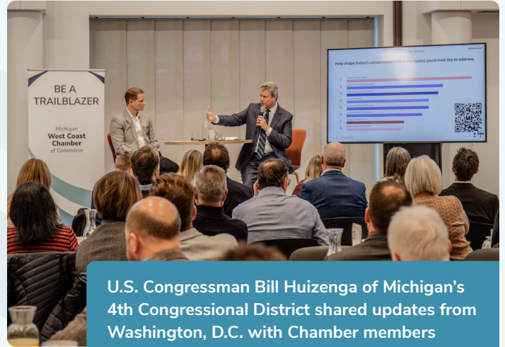
U.S. Congressman Bill Huizenga of Michigan's 4th Congressional District shared updates from Washington, D.C. with Chamber members during a morning of advocacy and conversation.