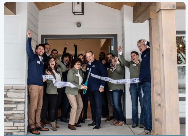
Heartland Builders celebrated the grand opening of their new design studio and office in Holland.