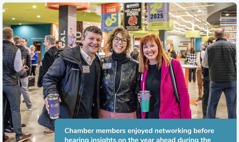
Chamber members enjoyed networking before hearing insights on the year ahead during the Economic Forecast program.