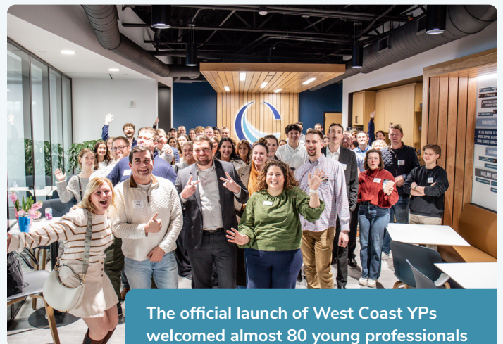
The official launch of West Coast YPs welcomed almost 80 young professionals from across the Lakeshore.