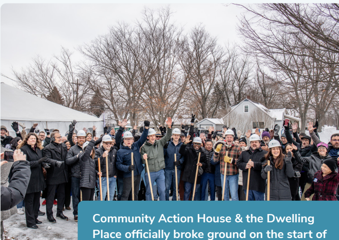
Community Action House & the Dwelling Place officially broke ground on the start of a new Kollen Park Housing Development.