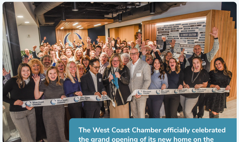
The West Coast Chamber officially celebrated the grand opening of its new home on the third floor of The Next Center.