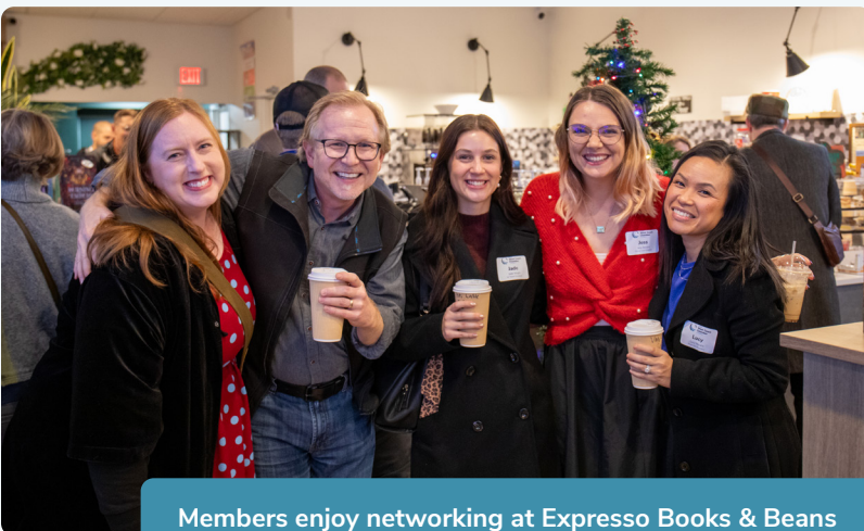
Members enjoy networking at Espresso Books & Beans during a Social Hour sponsored by 4Front Credit Union.